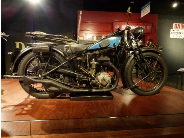
1929 Sidevalve single. Model unknown