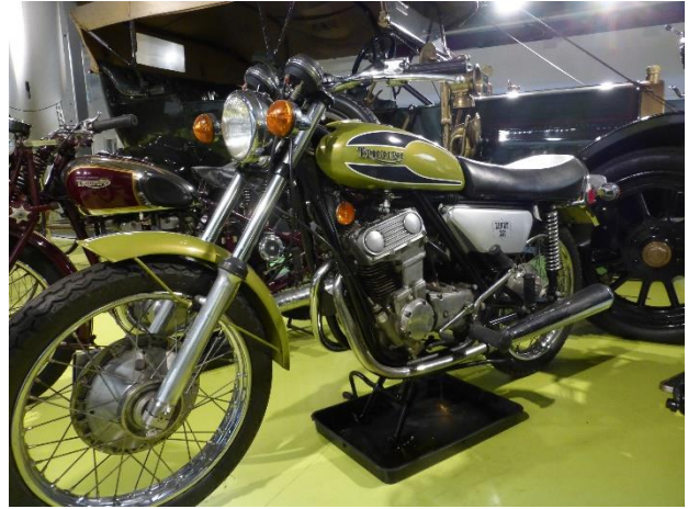
1971 350cc DOHC Bandit