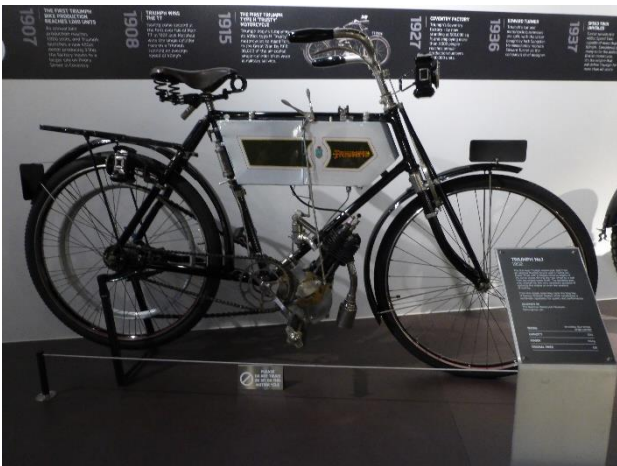
"No.1" The oldest known Triumph from 1902