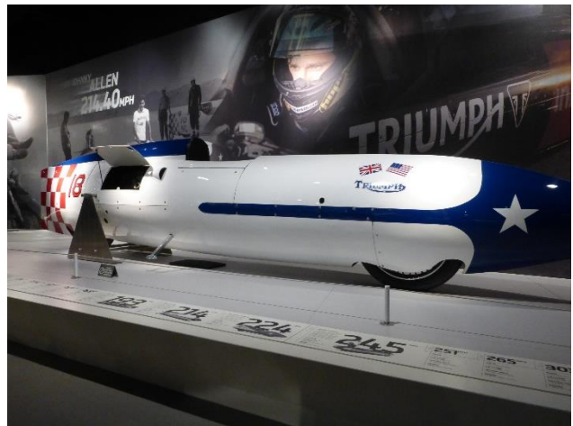
The 1956 World Land Speed Record machine